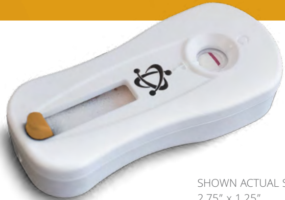
SHOWN ACTUAL SIZE 2.75" x 1.25"

Whether you're using Dekkera/Brettanomyces species in your intentionally inoculated brands or protecting your "clean" ones – early detection provides brewers the opportunity to manage and produce a consistent, quality, flavorful brew every time.